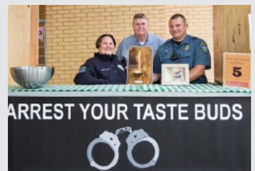
The Department of Public Safety won two awards at the first-ever SCC chili cook-off – Best Group Name and Best Overall Taste.