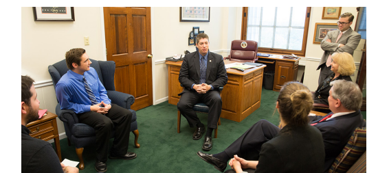
SCC representatives meet with Senator Bill Eigel as part of the Day at the Capitol activities.