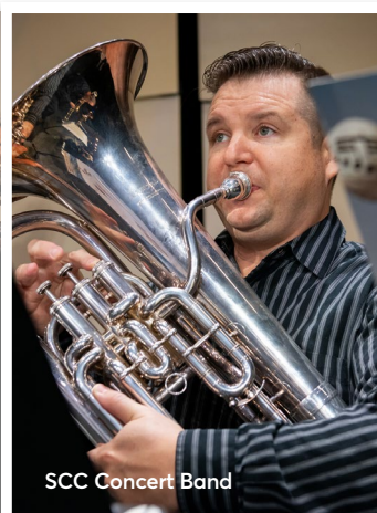
SCC Concert Band