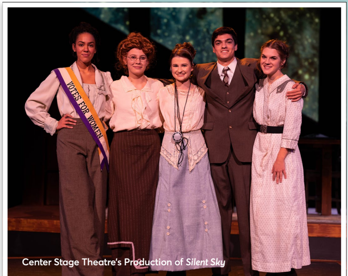
Center Stage Theatre's Production of Silent Sky