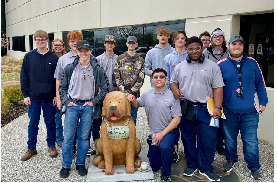
SCC MegaTech students visit Newco Coffee on Thursday, April 4.